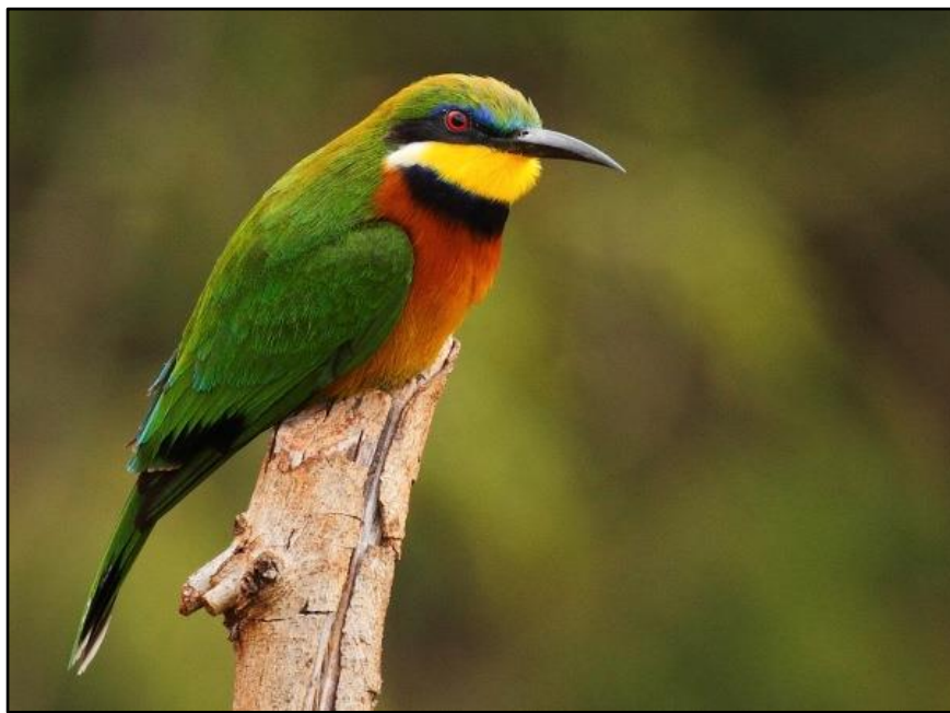
Cinnamon-chested Bee-eater at the Rift Valley Escarpment

Short-toed Lark were found in the barren, sandy and over-grazed plains in the eastern Mara, while the denser acacia woodlands gave us Bare-faced Go-away-bird, Common Scimitarbill, the highly threatened Southern Ground Hornbill, Purple Roller, Red-fronted Tinkerbird, Usambiro and Red-fronted Barbets, Eastern Grey Woodpecker, Pygmy Falcon, Magpie Shrike, the scarce, striking and range-restricted Red-throated and White-bellied Tits, Red-faced Crombec, Black-lored Babbler, the stunning Violet-backed and Hildebrandt's Starlings, Speckle-fronted, Chestnut and Grey-capped Social Weavers, Golden-