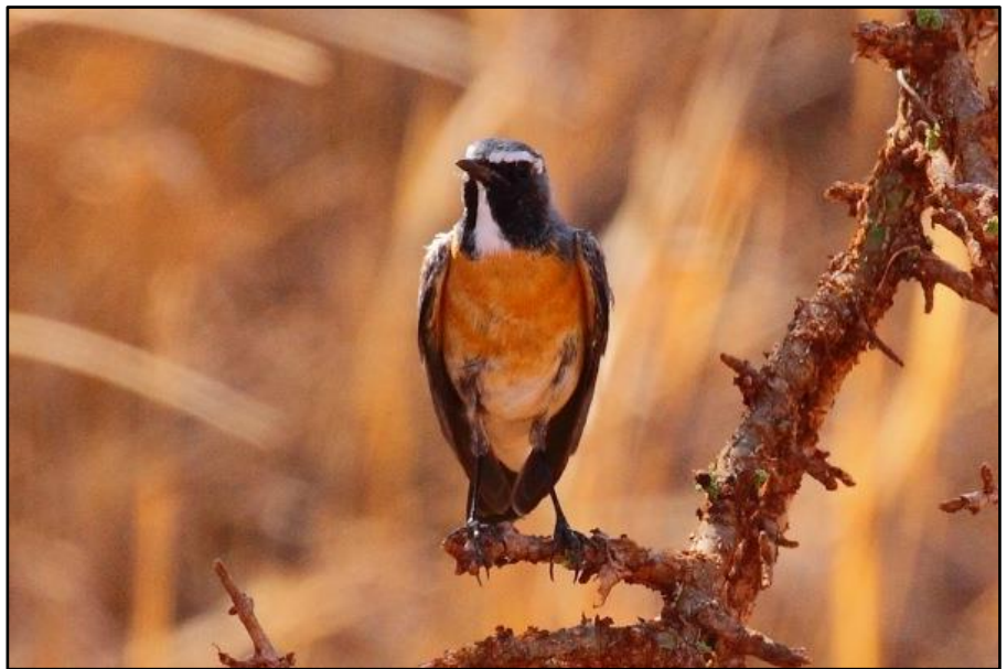
White-throated Robin (Irania) in Tsavo West

Our full day in Tsavo West National Reserve was spectacular to say the