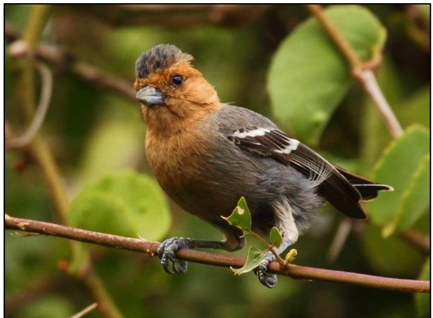
The localised Red-throated Tit in Maasai Mara

The Maasai Mara was an awesome birding and wildlife