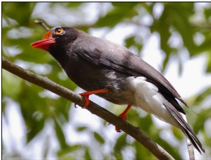
Chestnut-fronted Helmetshrike at Shimba Hills

The next day we targeted the remaining key species at Shimba Hills with our pre-breakfast drive proving extremely productive as we managed to acquire superb views of the much-desired Green-headed Oriole, Chestnut-fronted and Retz's Helmetshrikes, East Coast Boubou, White-eared Barbet, Yellow-bellied Greenbul, Black-bellied Starling, Green-backed Woodpecker and Trumpeter Hornbill, as well as the rare and beautiful Black-and-rufous Sengi. The late morning in the reserve gave us a number of raptors like, Bateleur, Martial and Wahlberg's Eagles, Palmnut Vulture, African Harrier-Hawk and Gabar Goshawk, as well as Yellow-throated Longclaw. After a picnic lunch at the Reserve entrance, we embarked on the fairly lengthy, all-afternoon drive northwards to Watamu Bay, our comfortable base from where to access the nearby Arabuko-Sokoke