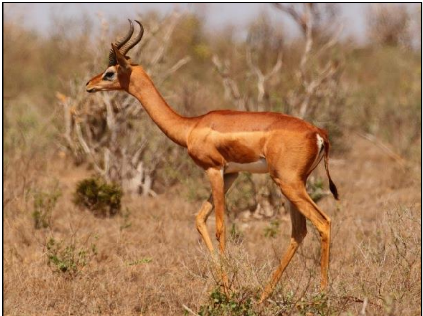
The unique Gerenuk in Tsavo East

Leaving Watamu Bay, we first enjoyed some close views of nesting Golden Palm and Eastern Golden Weavers in our resort grounds before hitting the road to Tsavo East. The drive took us past the northern end of the Arabuko-Sokoke Forest where several swifts were attracted to a nearby storm-front. This proved immensely fortuitous indeed as we found several of the rare and little-known Forbes-Watson's Swifts passing through with the more common and widespread Little and Common Swifts, as well as a single massive Mottled Swift. Nearby, a handsome Lizard Buzzard observed the swift-excitement unperturbed. Thereafter, we continued the drive westwards to our breakfast spot at the edge of a nearby wetland. The thickets and scrub in this area were particularly productive and birdy and we quickly found and enjoyed views of several Eurasian Golden Orioles, as well as a single Coastal Cisticola, another group of Scaly Babbler, Rufous Chatterer and the attractive and melodic Spotted Palm Thrush. After a roadside picnic breakfast, we took a short walk across the cultivated fields towards the wetland-edge, which produced some close and photographable Northern Carmine Bee-eaters, several Red-backed Shrikes, a fleeting Northern Brownbul and the hoped-for cherry on top in the form of a flock of Zanzibar Red Bishops. Thereafter,