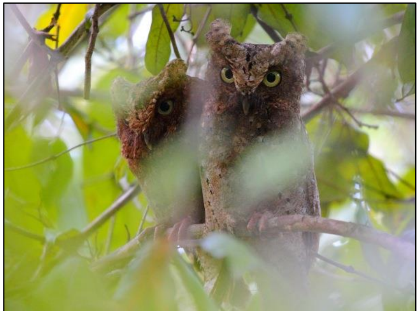
Sokoke Scops Owl (pair) at Arabuko-Sokoke