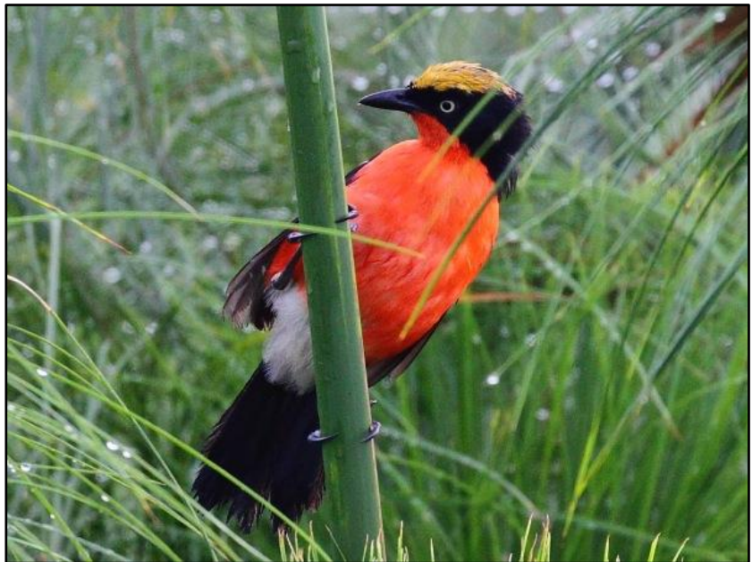
Papyrus Gonolek at Lake Victoria

We had a day and a half to explore and rack up as many of Kakamega's amazing avifauna as possible and what an awesome time we had! Initially, we explored the lodge grounds in the early morning, which yielded many of the species seen yesterday afternoon, as well as the impressive Black-and-white Casqued Hornbill, the highly localised and otherwise scarce Uganda Woodland Warbler, Bocage's Bushshrike, Mackinnon's Shrike, several Sharpe's Drongos, a flock of Northern Yellow White-eye, Chubb's Cisticola, African Thrush, Grey-chinned and Northern Double-collared Sunbirds, Red-headed Malimbe, Grey-headed Nigrita and Stuhlmann's Starling perched up on dead snags. Thereafter, we drove a short distance and entered the forest-proper in the heart of the Reserve where we spent the remainder of the morning meandering along the extensive network of wide, flat forest paths. Activity was good as usual but the birding as a whole was fairly challenging as many species kept to the highest canopy or only showed themselves briefly. However, with patience and perseverance we managed to obtain good views of most species and highlights included Blue Malkoha, Yellow-crested Woodpecker, Kakamega Greenbul, Western Oriole and the highly localised Turner's Eremomela in