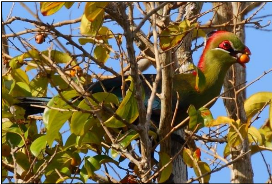
Fischer's Turaco at Arabuko-Sokoke

Forest and other regional birding hotspots. Although essentially just a commute between destinations, we did encounter a few noteworthy species during the drive and these included Sombre Greenbul, Long-tailed Fiscal, Northern White-crowned Shrike, Blue-cheeked Bee-eater and a magnificent pair of Black-collared Barbet, a very rare species for Kenya, soon after leaving Shimba Hills.