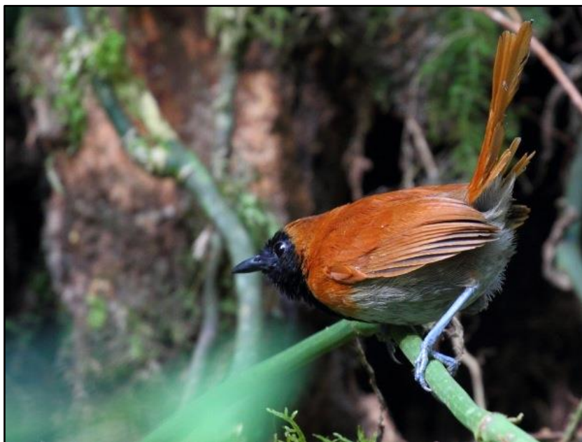
Black-faced Rufous Warbler at Kakamega

The next day was another long travel day but we made the most of it and actually managed to find some really great birds, many of which were highland species that we did not expect to encounter during this tour. Our first scheduled stop at the Rift Valley Escarpment yielded a staggering number of good-quality highland forest-edge species such as the spectacular Golden-winged and Eastern Double-collared Sunbirds, Streaky Seedeater, African Hill Babbler, Kikuyu White-eye, Tropical Boubou, European Blackcap, Hunter's Cisticola and Yellow-crowned Canary. Further along the drive, a handsome Mountain Buzzard perched at the roadside was a great surprise and our lunch stop at the edge of a decent little native forest patch gave us Yellow-rumped Tinkerbird, Greater and Lesser Honeyguides, Tree Pipit and White-eyed Slaty Flycatcher. Finally, after a long drive, we arrived at Kakamega rainforest and the very comfortable and well-appointed Rondo Retreat, our lovely base for the next two nights. Despite the initial drizzle, we ventured out for some late afternoon birding around the lodge grounds and forest edge after some welcome coffee