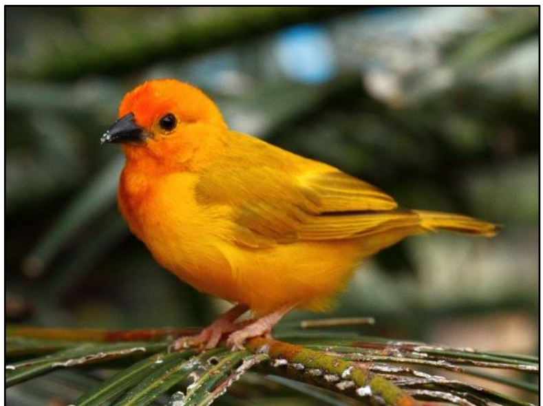
Golden Palm Weaver at Watamu Bay