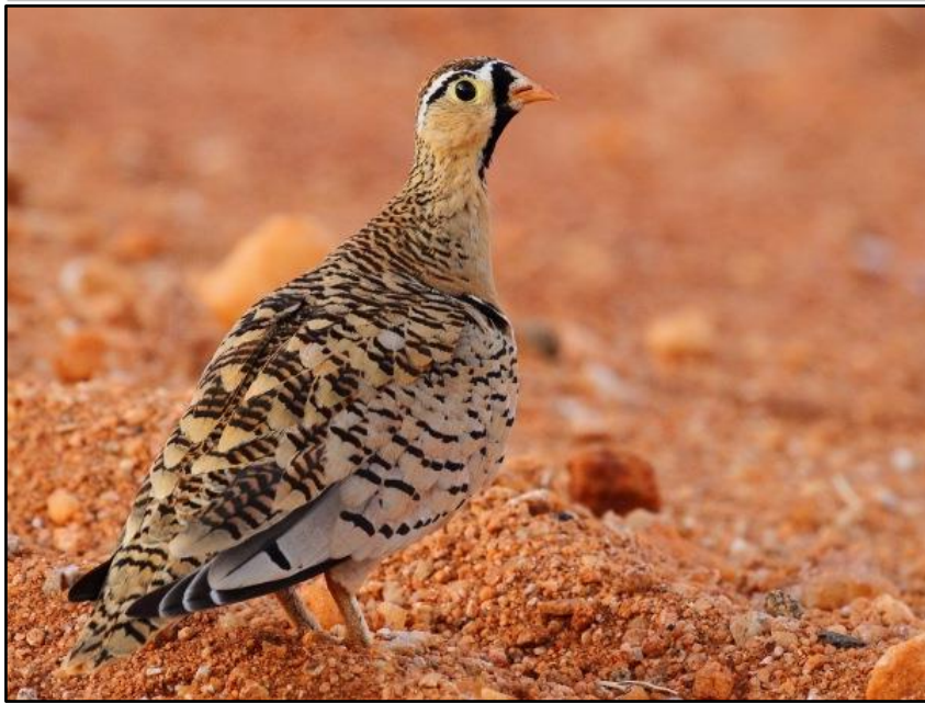
Black-faced Sandgrouse in Tsavo East

of Scaly Babbler and the scarce, migrant Basra Reed Warbler that popped out briefly on two occasions for decent views. At the estuary, we scoped thousands of shorebirds that included a single Saunders's Tern, fair numbers of Sooty and Lesser Black-backed Gulls, White-winged and Caspian Terns, a single adult Crab-plover that showed at much closer range than the Mida Creek birds, several Greater and Lesser Sand Plovers, large numbers of Pied Avocet, several Pink-backed Pelicans, Yellow-billed Stork, African Spoonbill, Western Reef Heron, Eurasian Curlew, Eurasian Whimbrel, some distance flocks of