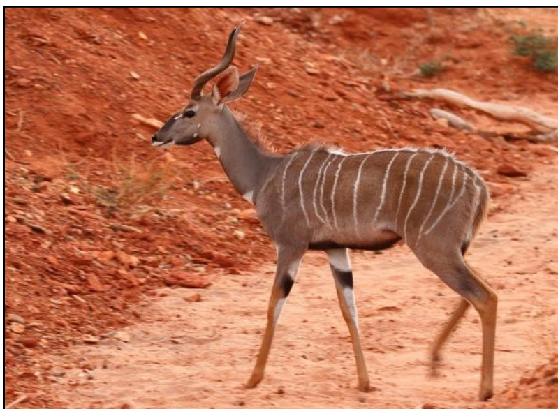
Lesser Kudu in Tsavo East