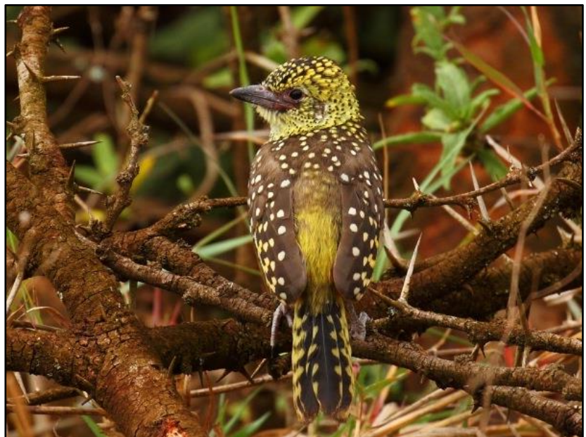
Usambiro Barbet in Maasai Mara

Our final day at Kakamega saw us attempting to mop up the remaining target species of the area. We succeeded in finding many of these, as well as obtaining better views of several already-recorded species. The early morning session at the edge of the gardens provided us with memorable views of the much sought-after White-spotted Flufftail that showed especially well. Grey-winged Robin-Chat also popped up briefly, while a family group of Scaly-breasted Illadopsis performed superbly at close range. Returning to the primary forest, we achieved better views of the colourful and vocal but rather unobtrusive Yellow-spotted and Yellow-billed Barbets, as well as Slender-billed Greenbul and we also managed to turn up a Honeyguide Greenbul, a few Scarce Swifts overhead, the shy and unobtrusive Brown-eared Woodpecker, Tambourine Dove, Petit's Cuckooshrike, some distant and backlit