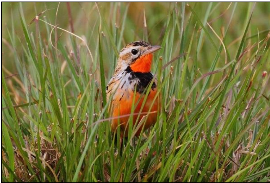
Rosy-throated Longclaw in Maasai Mara

Dusky Tits and several furtive Blue-shouldered Robin-Chats. In a moist, grassy glade at the forest-edge, we added a number of excellent new species and were especially pleased with a soaring Crowned Eagle, several brilliant Orange-tufted Sunbirds, Stout Cisticola, Yellow-mantled Widowbird and a flushed Blue Quail. To end off a productive final morning at Kakamega, we located a cooperative Green Hylia. It was then time to depart on the fairly short drive southwards to the edge of Lake Victoria where we birded the