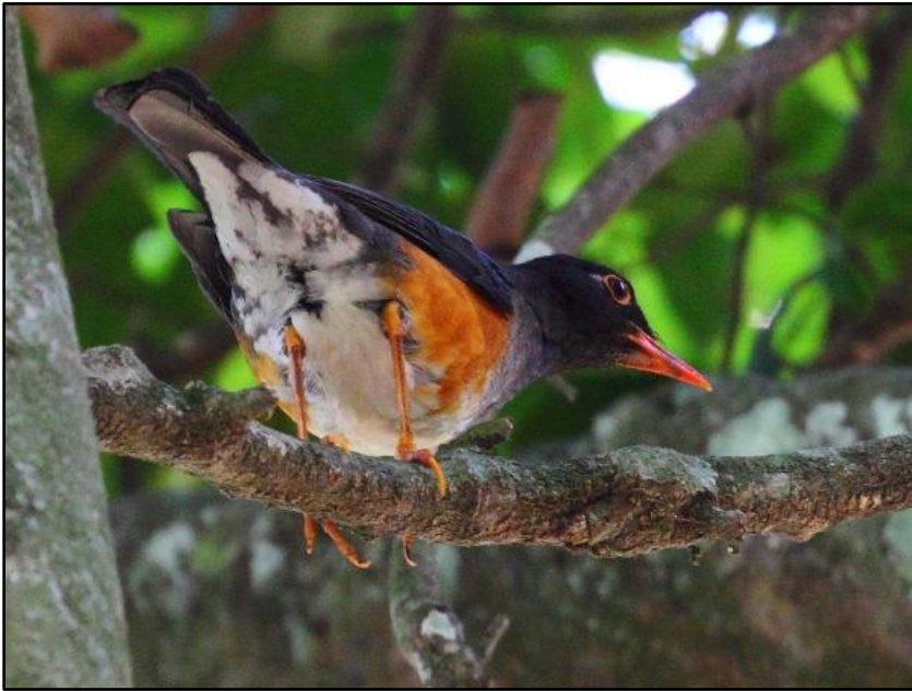
The rare and endemic Taita Thrush in the Taita Hills

least and produced an impressive list of East African arid acacia specialties. The impressive and bird-rich lodge grounds yielded Pringle's Puffback, Orange-breasted and Grey-headed Bushshrikes, Yellow-breasted Apalis, Black-necked Weaver, the scarce and beautiful Grey-headed Silverbill and Cinnamon-breasted Bunting, while the various habitats covered by the network of roads produced Rüppell's Vulture, Black-chested and Brown Snake Eagles, the impressive Verreaux's Eagle scouring the rocky outcrops for Hyrax, the handsome Augur Buzzard, migratory Lesser Spotted Eagle, the partially-diurnal Pearl-spotted Owlet, extremely localised and uncommon Grant's Woodhoopoe, D'Arnaud's Barbet, Pygmy Falcon, Pygmy Batis, flocks of raucous and flashy White-crested Helmetshrike, Brubru, a pair of minute Mouse-colored Penduline Tit, Northern Crombec, Ashy and Tiny Cisticolas, Yellow-billed Oxpecker, Bare-eyed Thrush, a flock of Black-capped Social Weaver, the stunning Purple Grenadier, Green-winged Pytilia, Somali Bunting and a flock of Straw-tailed Whydah. The afternoon session towards Ngulia Lodge gave us many of the same species already mentioned, as well as the scarce Eastern Yellow-billed Hornbill, while Verreaux's Eagle-Owl and Slender-tailed Nightjars performed well during our nocturnal observations around the lodge waterhole and grounds.