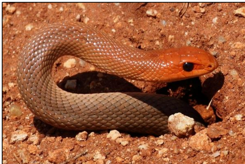
Rufous Beaked Snake in Tsavo West

Oryx, Yellow-winged Bat and Coke's Hartebeest.