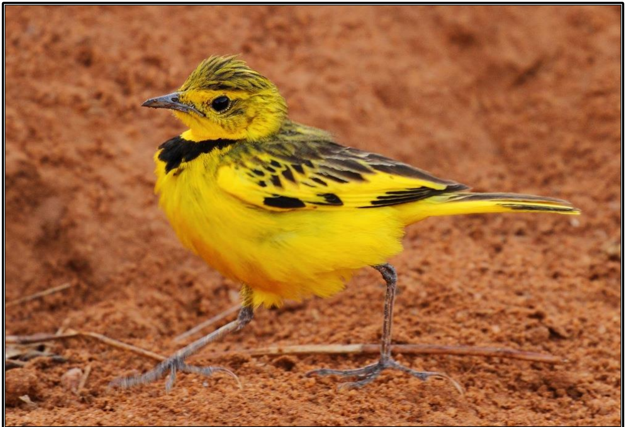
Golden Pipit (male in breeding plumage) in Tsavo West National Park

Trip report compiled by Tour Leader: Glen Valentine