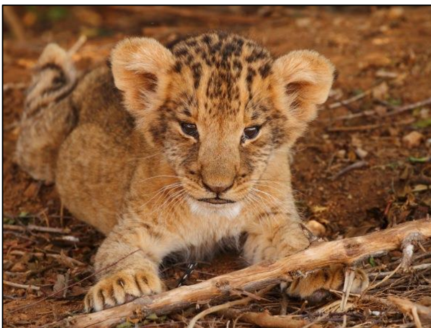
Lion cub in Tsavo East

The remainder of the afternoon essentially involved steady driving, to reach our amazing accommodations towards the north-western edge of Tsavo West.