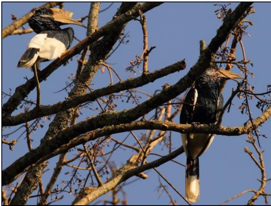
Black-and-white Casqued Hornbills at Kakamega

and once the rain had subsided. Although it was overcast and almost dusk, we still managed to find several exciting introductory species, all of which we'd see again over the course of the next day and a half: Grey-throated Barbets were nesting in the dead trees, while pairs of Yellow-throated Leaflove and Joyful Greenbul chattered noisily in the canopy and revealed themselves momentarily. The gorgeous and active African Blue Flycatcher was also present together with a male Green-headed Sunbird, Brown-capped and Vieillot's Black Weavers and fair numbers of striking White-eyed Saw-