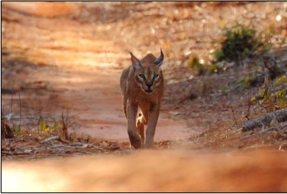
The rare & seldom-seen Caracal at Arabuko-Sokoke