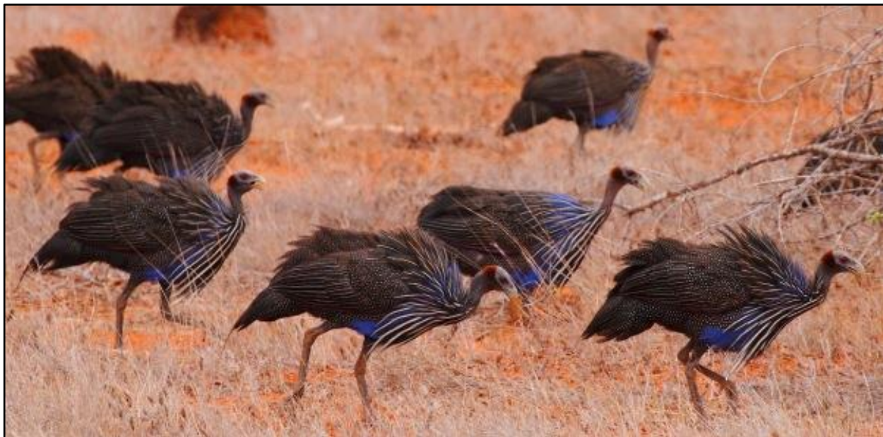
Vulturine Guineafowl in Tsavo East