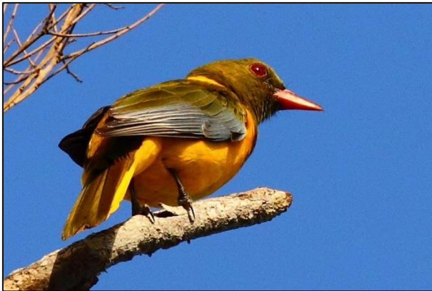
Green-headed Oriole at Shimba Hills

Our much-anticipated, inaugural Kenya Highlights tour began with a flight from Nairobi to Ukunda, a small but bustling town on Kenya's south-eastern coastline. After arriving around midday, we drove the short distance up to Shimba Hills National Reserve, encountering our first of several stunning Northern Carmine Bee-eaters along the way. We had the late afternoon to begin our birding in the tall, beautiful but low-density miombo woodlands around the lodge and in the Reserve and quickly got stuck into several of the area's specialties: Green Barbets