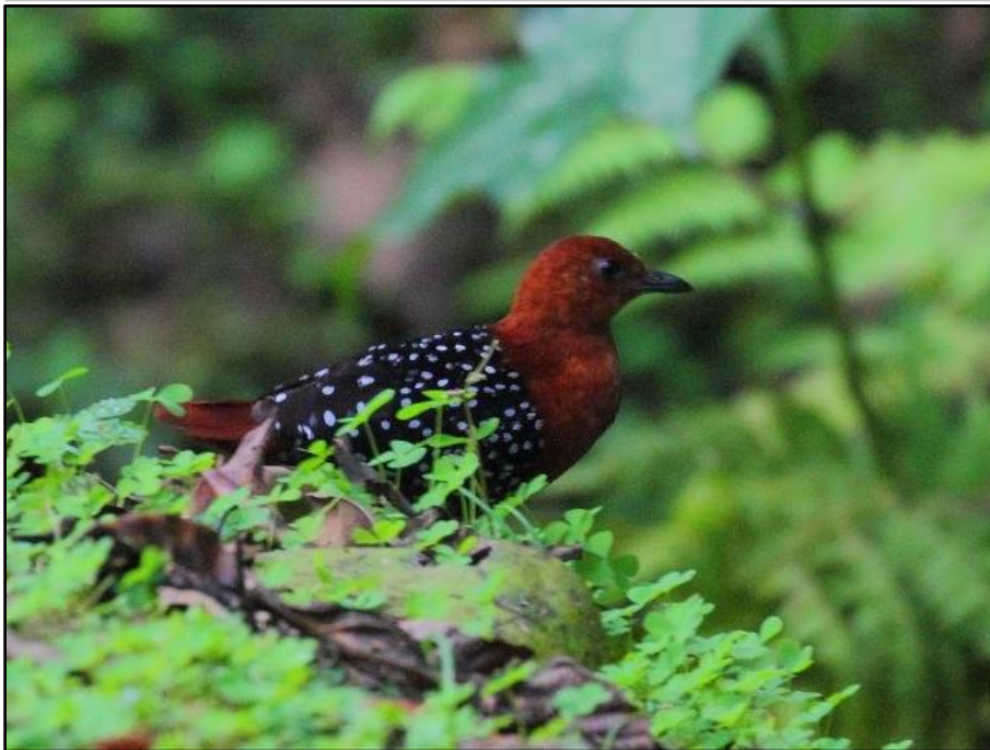
White-spotted Flufftail at Kakamega

mixed species flocks, Equatorial Akalat, Brown-chested Alethe and Red-tailed Bristlebill at an ant swarm, a highly vocal and responsive Least Honeyguide, the scarce and often-elusive Red-chested Owlet, a pair of Chestnut Wattle-eye, White-chinned Prinia, Olive-green Camaroptera, the stunning Black-faced Rufous Warbler and Yellow-whiskered, Little, Cabanis's and Little Grey Greenbuls. Primates of various kinds were also admired and included Red-tailed and Blue Monkeys, as well as the impressive Guereza Colobus.