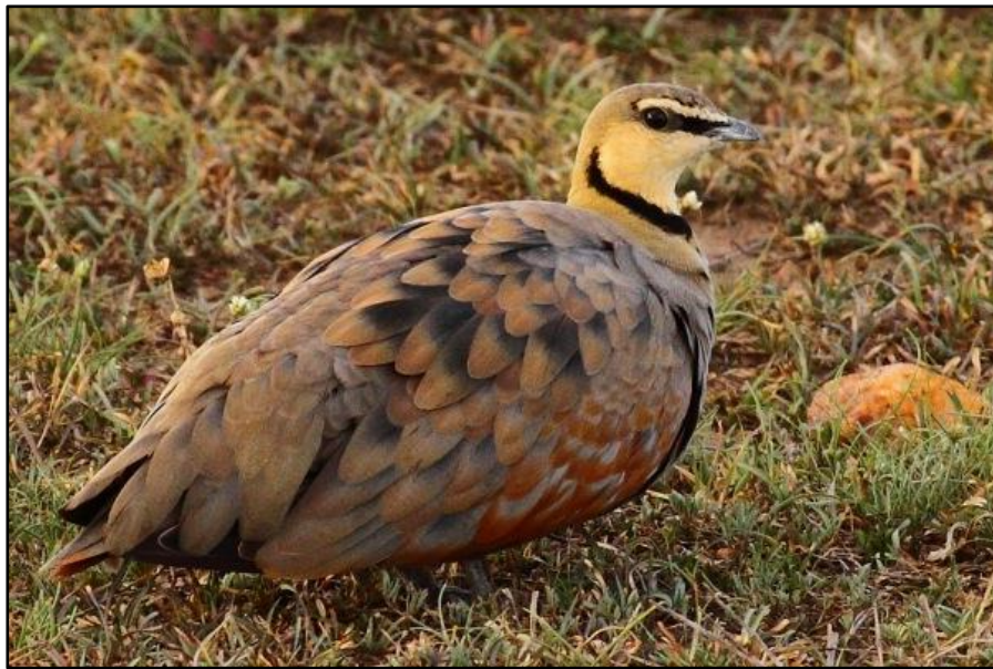
Yellow-throated Sandgrouse in Maasai Mara

experience as always and our two full days in this vast and beautiful reserve yielded a bounty of memorable sightings and species. Mammal highlights included several Lion sightings, four Cheetah feasting on a freshly killed Impala right next to the road, large herds of African Elephant and African Buffalo, several Black-backed Jackal, Bohor Reedbuck, Eland, Waterbuck, Coke's Hartebeest, Grant's Gazelle and Hippo, vast herds of Plains Zebra, Common Wildebeest, Thompson's Gazelle, Topi and Maasai Giraffe, two separate Servals and large numbers of Spotted Hyena.